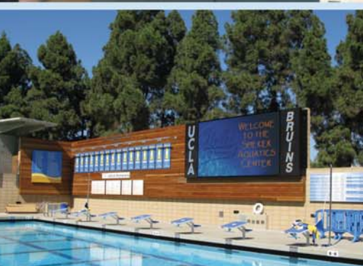
A view of the color scoreboard, school record list, and NCAA Championship banners