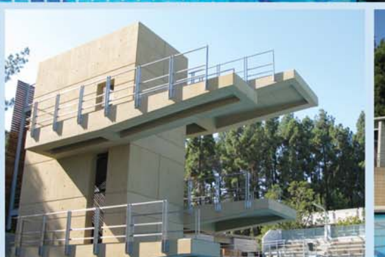
A view of the springboard and tower diving area featuring two 1M boards, two 3M boards and tower heights of 3M, 5M, 7M and 10M