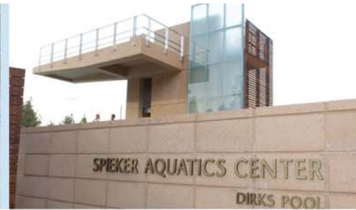
A view of the diving tower from the outside of the Spieker Aquatics Center