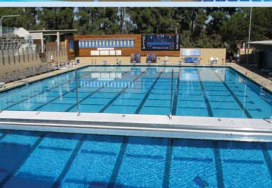
A view of Dirks Pool which is 52 meters by 25 yards deep